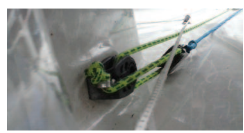
.on Chris's boat (fewer blocks) view through the transom flap