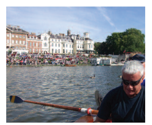
Crowds at Richmond

Now it is easier to row with a steady rhythm in the smooth water, and there is more shelter from the wind, so it is time to swap roles and to grab a quick bite to eat and to bask in the warm sun. The boat is still sitting down in the stern, and you can see the turbulence from the square stem sucking us back, so we move the passenger forward onto the foredeck which helps a little. Boats have now settled more into a steady order, and an element of increased competition develops as we identify individual rivals and start to race them for the finish. Soon, the final bridge at Richmond can be seen, with a huge crowd on the banks watching the race and enjoying a party atmosphere, complete with live music.