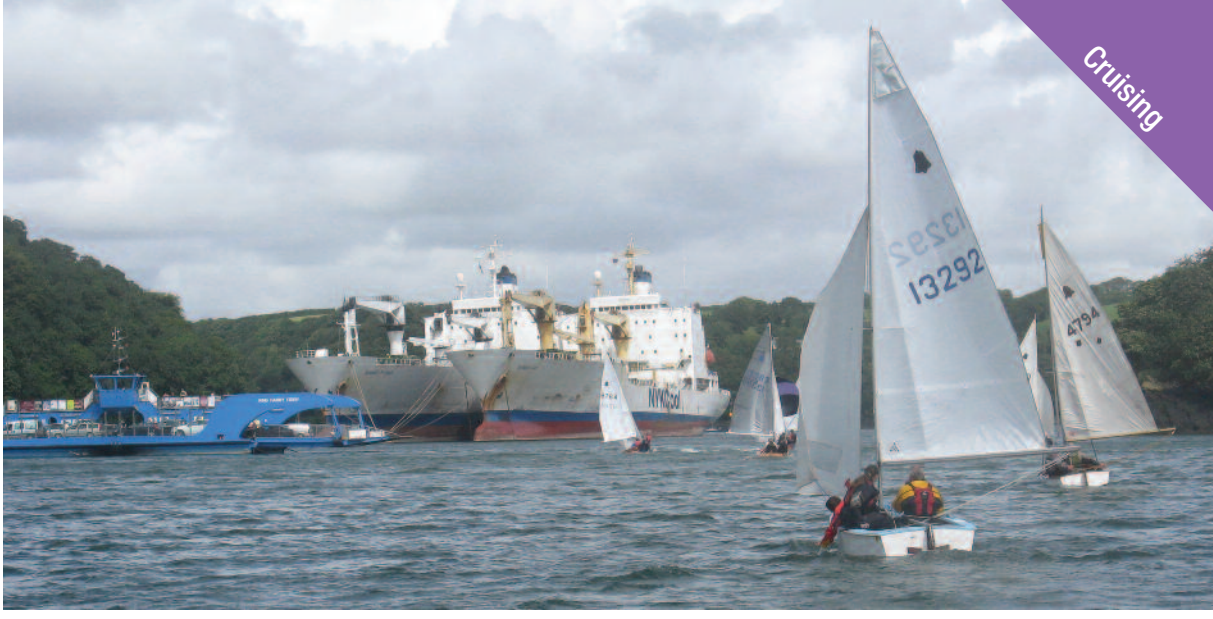
than sailing off Mylor point, than sailing off Mylor point, across the Roads at the kind The King Harry Ferry overshadowed by hulks on the River Fal

Beyond the ferry you start to encounter laid-up boats, clinging to moorings in the centre of the channel, while they await new work or to be decommissioned at the end of their life. They sit in the water creating large wind shadows, but also providing an interesting perspective of our world, waiting or rusting while surrounded by the beauty and peace of the River Fal with its lush green trees and bushes rising out of the steep banks on either side.