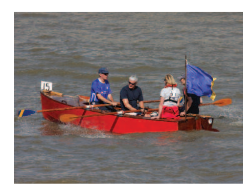
Leicester City shirt a tribute to the origins of the GP14

The Great River Race, a race rowed in traditional style boats and billed as 'London's River Marathon' takes place annually in September over a 21 mile course upstream from Millwall Dock to Ham House near Richmond. Cutters, gigs, longboats, dragon boat, skiffs, hawaiian outriggers, whalers, jolly boats, galleys, Dutch sloeps, wherries, yawls, and shallops (to name but a few) all compete in a colourful spectrum of over 300 oar-powered craft. And this year, possibly for the first time ever, the General Purpose 14 foot dinghy lived up to its name by proving that it is not just a sailing boat!