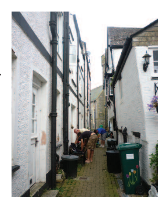
Backstreet in Looe

We will remember Looe for many things – the racing, the weather, the entertainment, the great prizes given by our sponsors, the kindness and efficiency of our hosts, but mostly we will remember it for the great sense of camaraderie that builds up in a small place where lots of people have a common purpose. Roll on Largs, the venue for the Nationals next summer, and roll on the next Worlds at East Down YC in 2014.