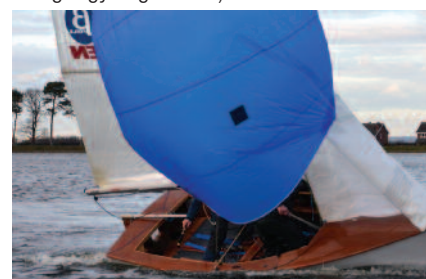
Maximum heel - notice how little rudder is used